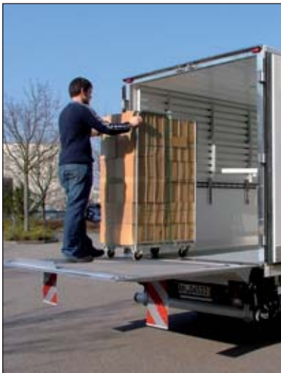
Efficient trolley transport with trolley stop 2ad or 2rd for two trolleys.