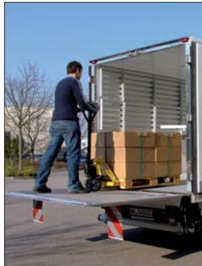
The BC 750S2 is stable and consequent also suitable for pallets. Platform safety with TracGrip and SideGrip.

The BC 751S2 is identically to the BC 750S2 from a technical point of view.